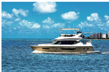
Marine / boats