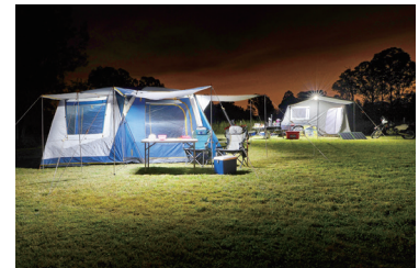
Back-up power / UPS