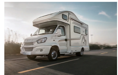
Motorhome / RV